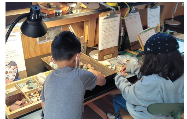
INVESTIGATIONS AREA IN THE FIELD STATION

If you have further questions please contact us at groupvisits@presidiotrust.gov