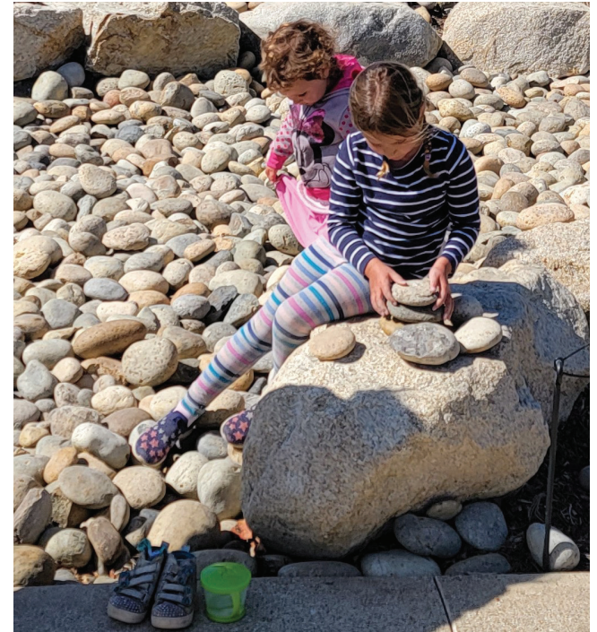
ROCK RIVER IN THE OUTPOST

There are typically at least 4 food trucks at Tunnel Tops on weekdays. Click here for information about food options at Tunnel Tops.