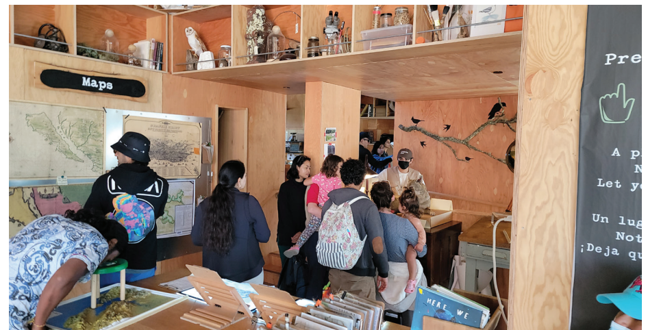
MAPS AREA IN THE FIELD STATION