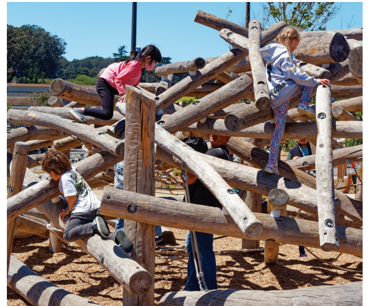
FOREST DEN IN THE OUTPOST

It's an independent experience but Field Station staff are always available to help.