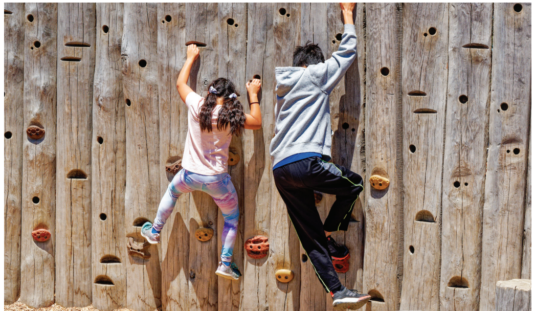
WOODLAND CLIMBING WALL IN THE OUTPOST