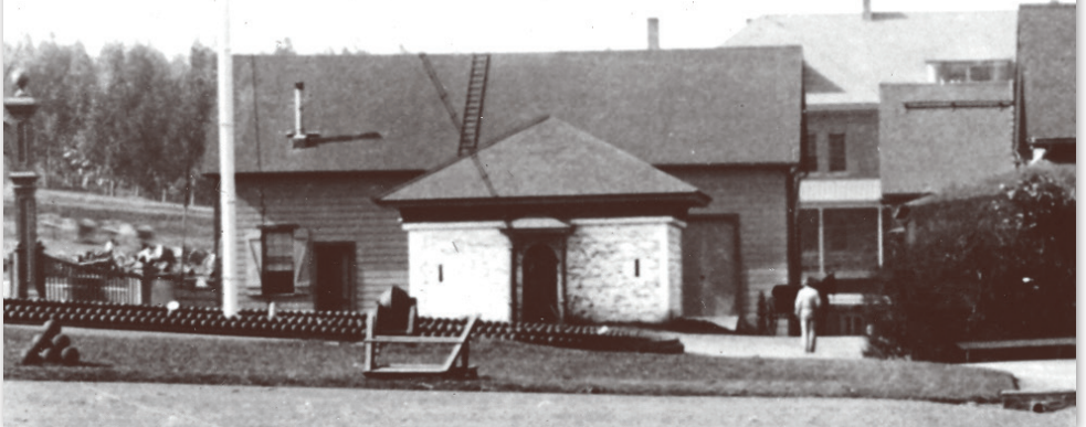
The Powder Magazine and surrounding American period structures, c.1900.

Located inside the historic Powder Magazine, 95 Anza Ave (see map on reverse). Open weekends, 10am to 4pm (Mar to mid-Nov) and 12pm to 3pm (mid-Nov to March), and weekdays by appointment. Call (415) 561-2767.