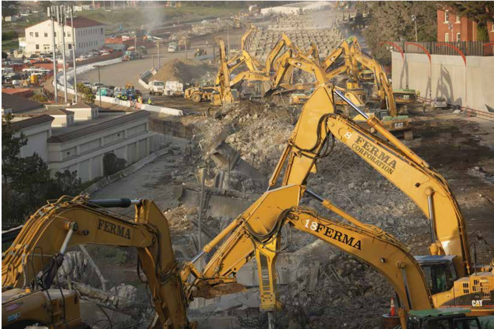
The 1937 elevated Doyle Drive is being replaced with the Presidio Parkway which will reconnect Crissy Field to the Presidio's Main Post. The former Commissary is to the left.