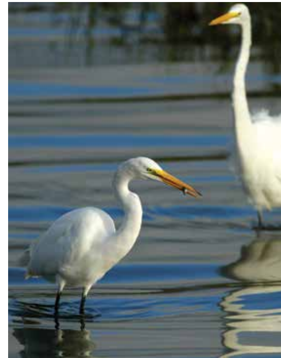
Great Egret in Crissy Marsh

More information about the Presidio Parkway can be found at www.presidioparkway.org .