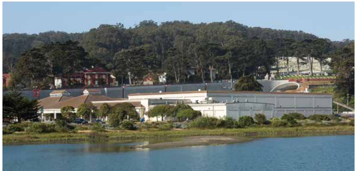
The Commissary was built by the U. S. Army in 1989. The 93,000 square foot building occupies one of the most prominent and beautiful locations in the Presidio.