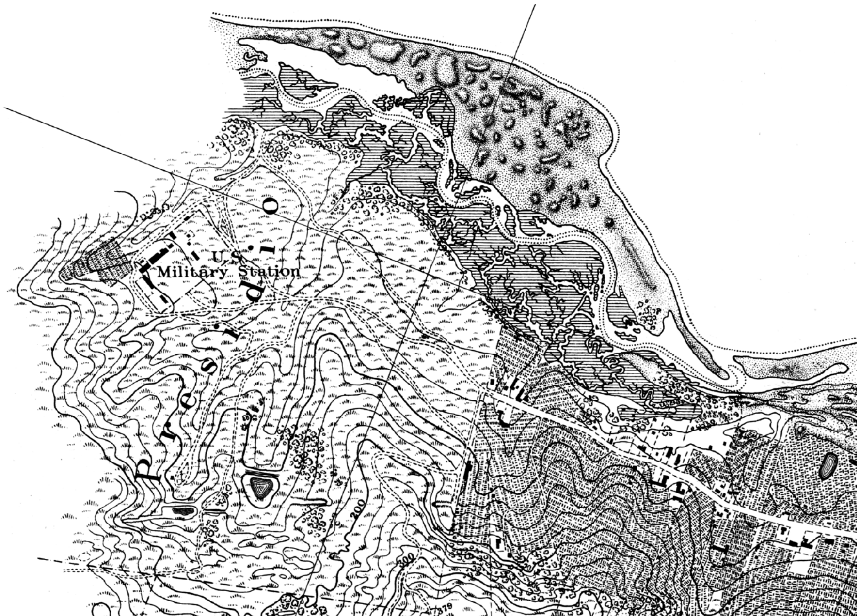
1857 U.S. Coast and Geodetic Survey showing the Salt Marsh