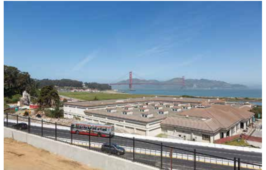
Crissy Field was a public recreational destination even when it was a military post. Today, it is the Presidio's front yard. The marsh was restored in 2001; the social life of Crissy Field blends with its natural beauty.