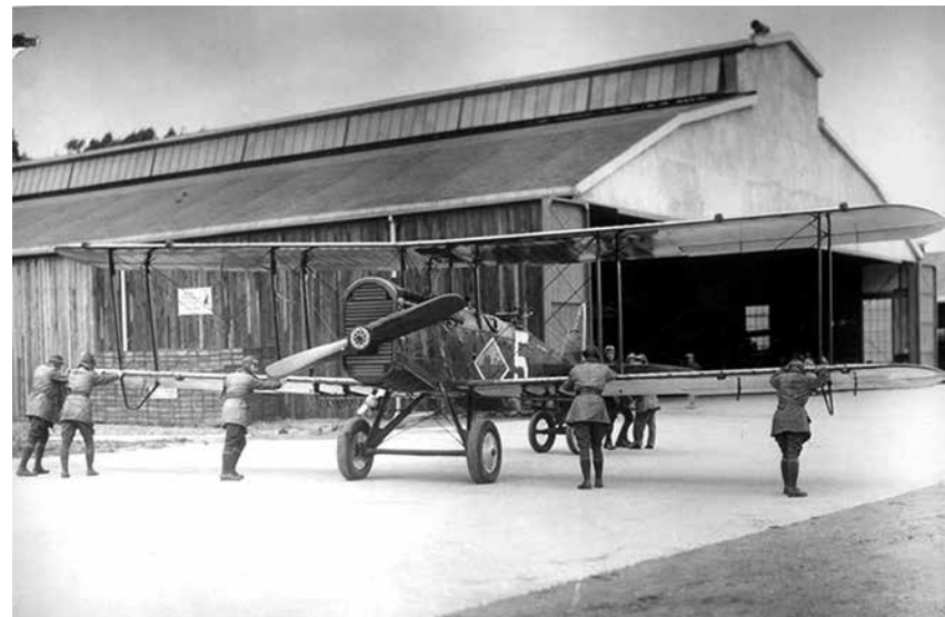
Crissy Field evolved through the decades of intensive military use. The marsh was filled following the 1906 Earthquake and the area was used for the 1915 Panama Pacific International Exposition, attractions included a racetrack. Before the Golden Gate Bridge was built in 1937, the area was a major airfield. Crissy Field was named for Major Dana Crissy, who died in October 1919 during one of the first transcontinental test flights.