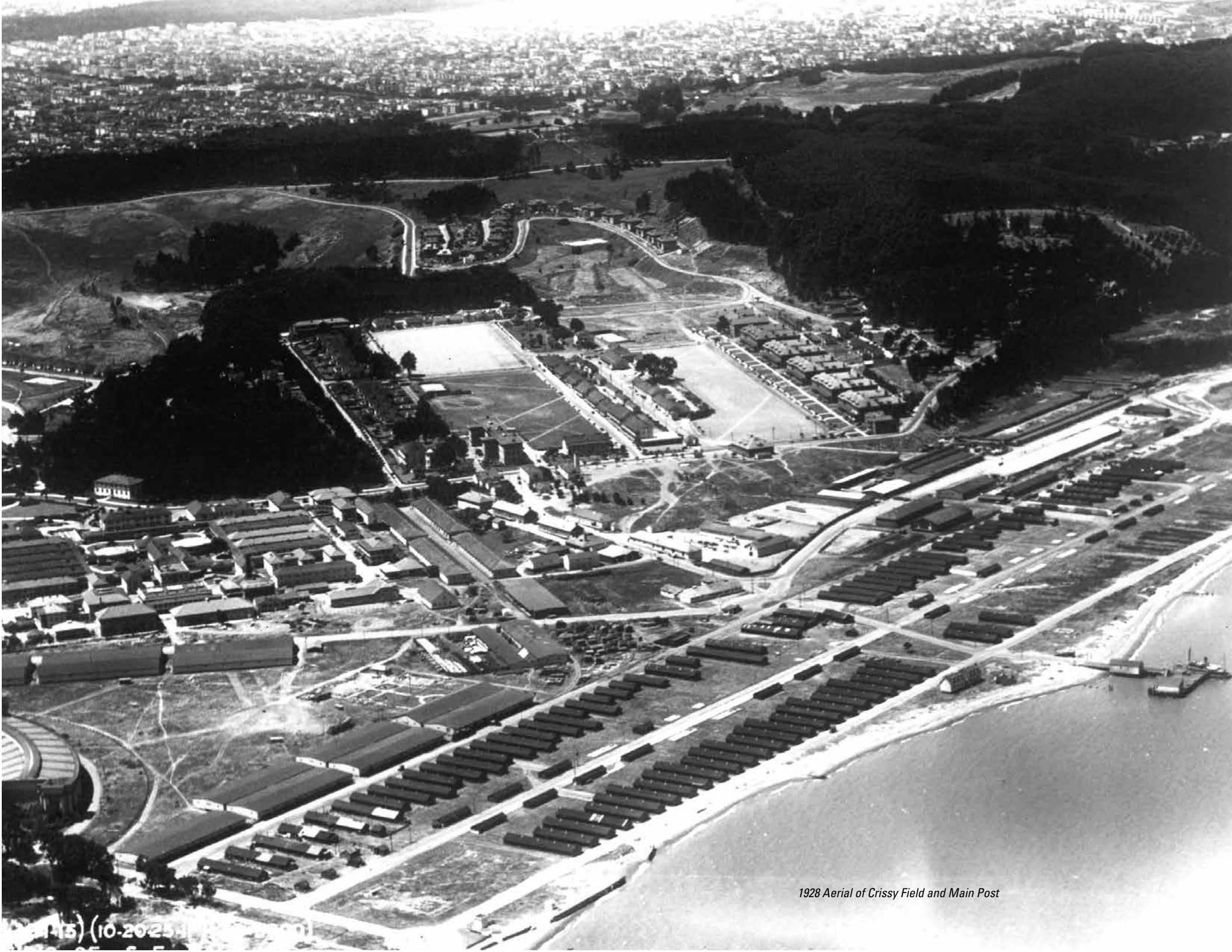
1928 Aerial of Crissy Field and Main Post