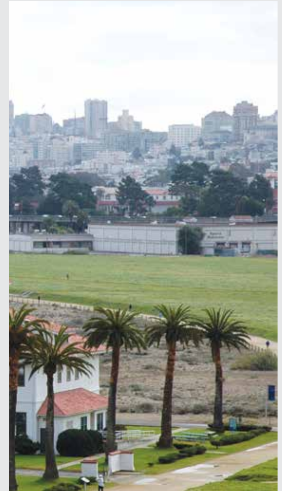
View East – Commissary in the background

Commercial General Liability, Business Automobile Liability, Workers' Compensation, and Professional Liability Insurance are required from entities that enter into a contract with the Presidio Trust. This information is being provided for informational purposes only. Insurance coverage and limits will be determined and an actual insurance requirement prepared based on the proposed project and operations.