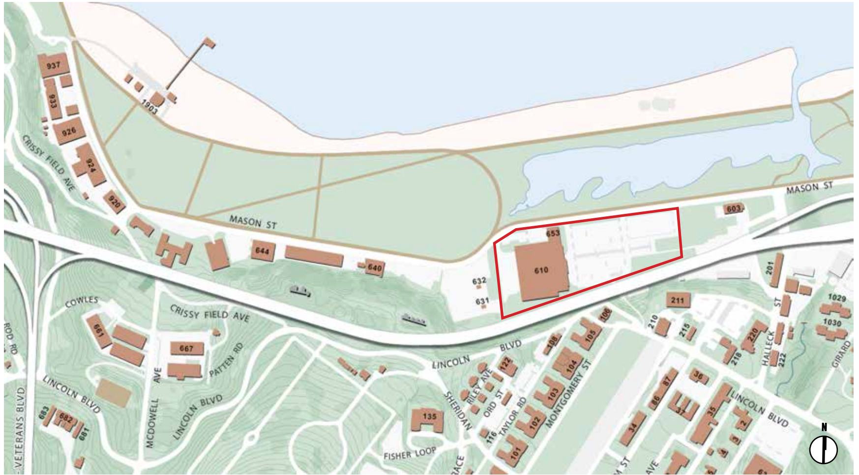
Crissy Field District