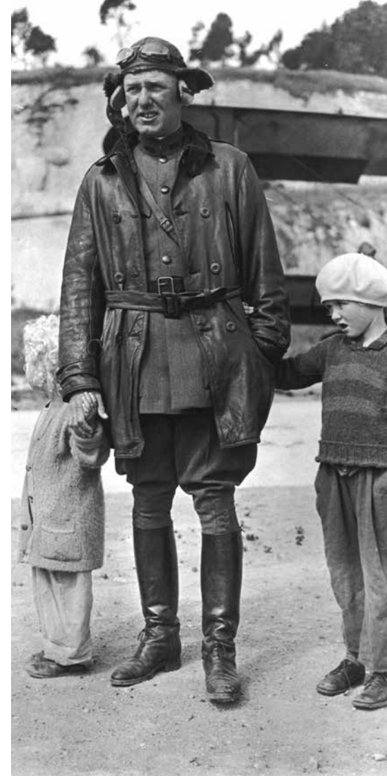
Crissy Field was the birthplace of West Coast Aviation.

The Presidio of San Francisco, founded in 1776 by Spain, is the birthplace of San Francisco. It was a U.S. Army post from 1846 to 1994, and was designated a National Historic Landmark District in 1962. Today, it is the gateway to the Golden Gate National Recreation Area, the largest urban national park in the country. The Presidio's 1,490 acres include 469 historic buildings, a 300-acre historic forest, diverse landscapes and natural areas, important archaeological sites, 24 miles of trails, scenic overlooks, and other recreational facilities. It is home to 280 native plant species and more than 200 species of birds and other wildlife. Approximately thirty-five hundred people work in the Presidio for businesses, non-profit and cultural organizations, and government agencies; another three thousand live in the Presidio. Four million people visit annually.