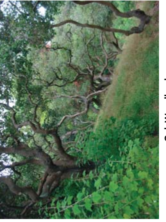
Oak Woodland Coast Live Oak, Toyon, Pink Flowering Currant