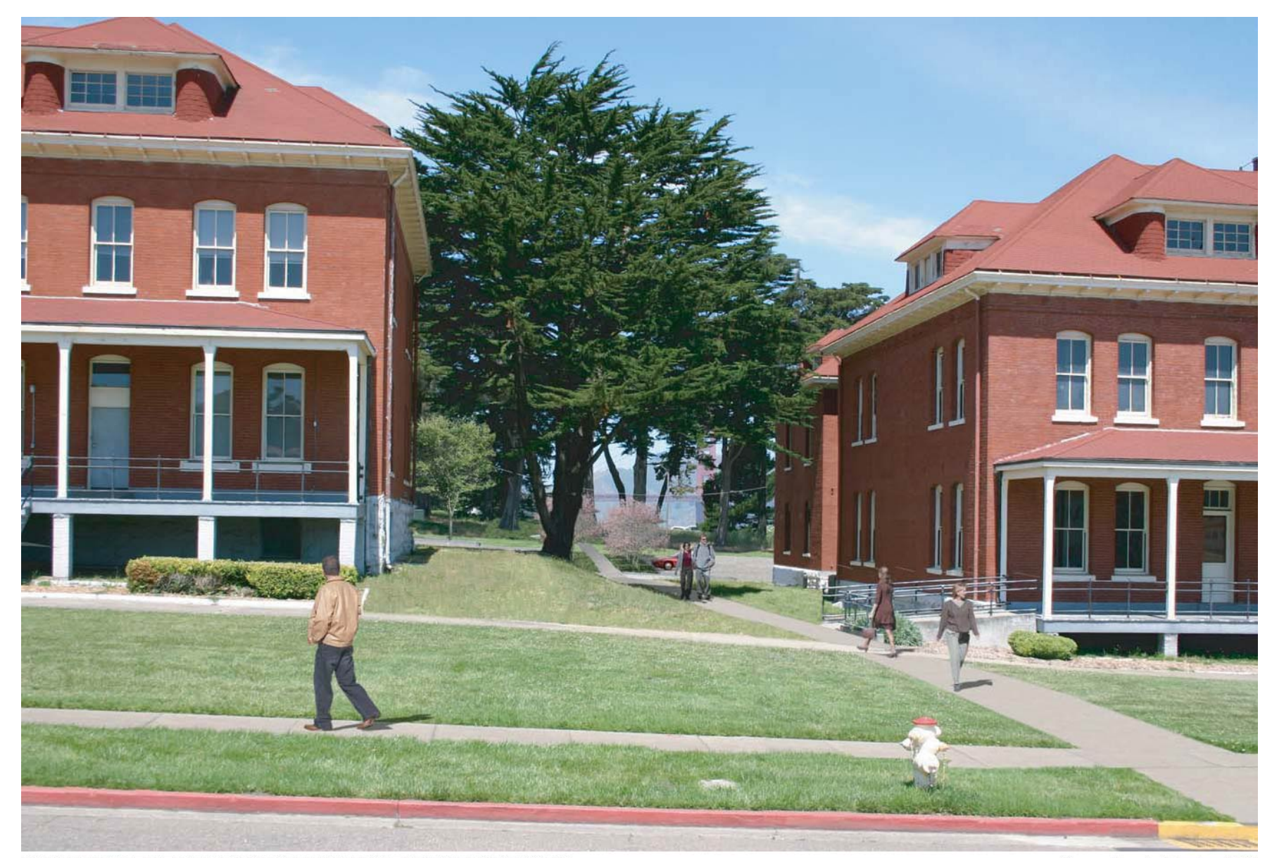
FIGURE 2: VIEW BETWEEN BUILDINGS 103 AND 104 FROM THE MAIN PARADE GROUND