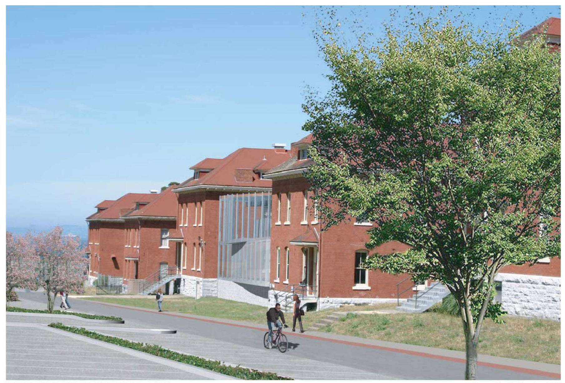
FIGURE 3: VIEW OF BUILDING 122 FROM TAYLOR STREET